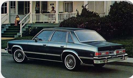
Malibu Classic Sedan shown in dark blue metallic with available sport mirrors, deluxe body side moldings, bumper rub strips and guards, wire wheel covers and white-stripe tires.

Sedans and Wagons feature fixed rear door picture windows with swing-out vents behind them to provide rear seat passengers with draft-free ventilation. But then, perhaps you're the sporty type. What'll make your heart jump is the Malibu Classic Sport Coupe (shown on cover). Don't let its crisp, sporty appearance fool you, though. Inside, it's as roomy and pleasurable as it is delightful to look at. You say there's a formal streak in your personality. Personally, we think the Malibu Classic Landau Coupe should be right up your driveway. It proudly wears a vinyl cover over the rear half-section of the roof. And the Landau roof is accented with glistening bright moldings plus bright edging framing the shiny black center pillar. Sport wheel covers and body side pinstriping add just the right touch. And remember, every Malibu Classic has some very fine touches that will endear it to its owners. Like added sound insulation. Like ashtray, glove compartment and courtesy lights. Like wheel opening moldings, bright taillight accents and bright body sill moldings. Like good old-fashioned deep-down Chevy value.