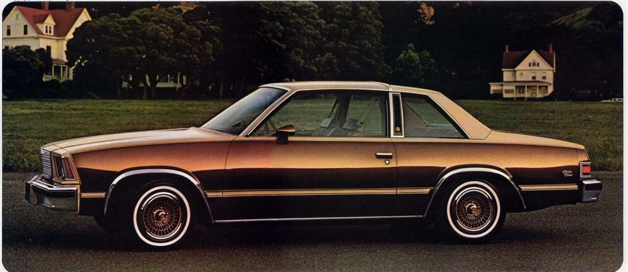
Malibu Classic Landau Coupe shown in available Custom Two-Tone beige and dark brown metallic with available sport mirrors, deluxe body side moldings, tinted glass, bumper rub strips and guards and white-stripe tires.