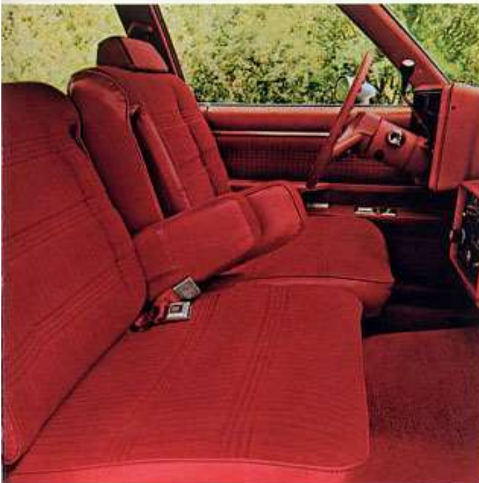
Malibu Classic available 50/50 front seat with dual fold-down armrests shown in carmine, with available deluxe color-keyed seat and shoulder belts, remote control sport mirror, power windows, AM/FM stereo radio, automatic transmission and air conditioning.