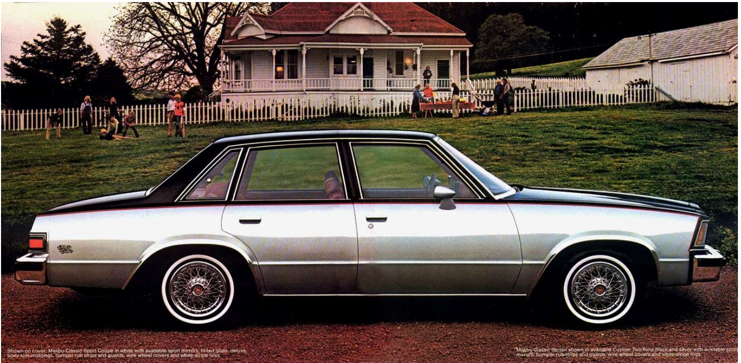
Shown on cover: Malibu Classic Sport Coupe in white with available sport mirrors, tinted glass, deluxe bumper rub strips and guards, wire wheel covers and white-stripe tires.