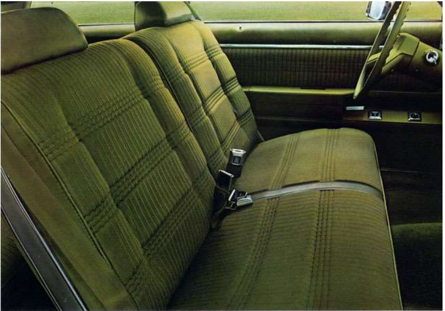
Malibu Classic standard knit cloth interior shown in green with available deluxe color-keyed seat and shoulder belts, remote control rearview mirror and power door locks.