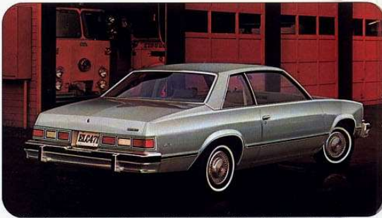
Malibu Sport Coupe shown in silver with available silver vinyl roof, deluxe body side moldings, wheel opening moldings, bumper rub strips and guards, full wheel covers and white-stripe tires.

Chevy Malibu. It's a lot of car to have around you, our mid-size value in both coupes and sedans. Or wagons. Because a Malibu Wagon packs over 72 cubic feet of cargo space with the rear seat folded down. For full details ask your dealer for a Station Wagon catalog.