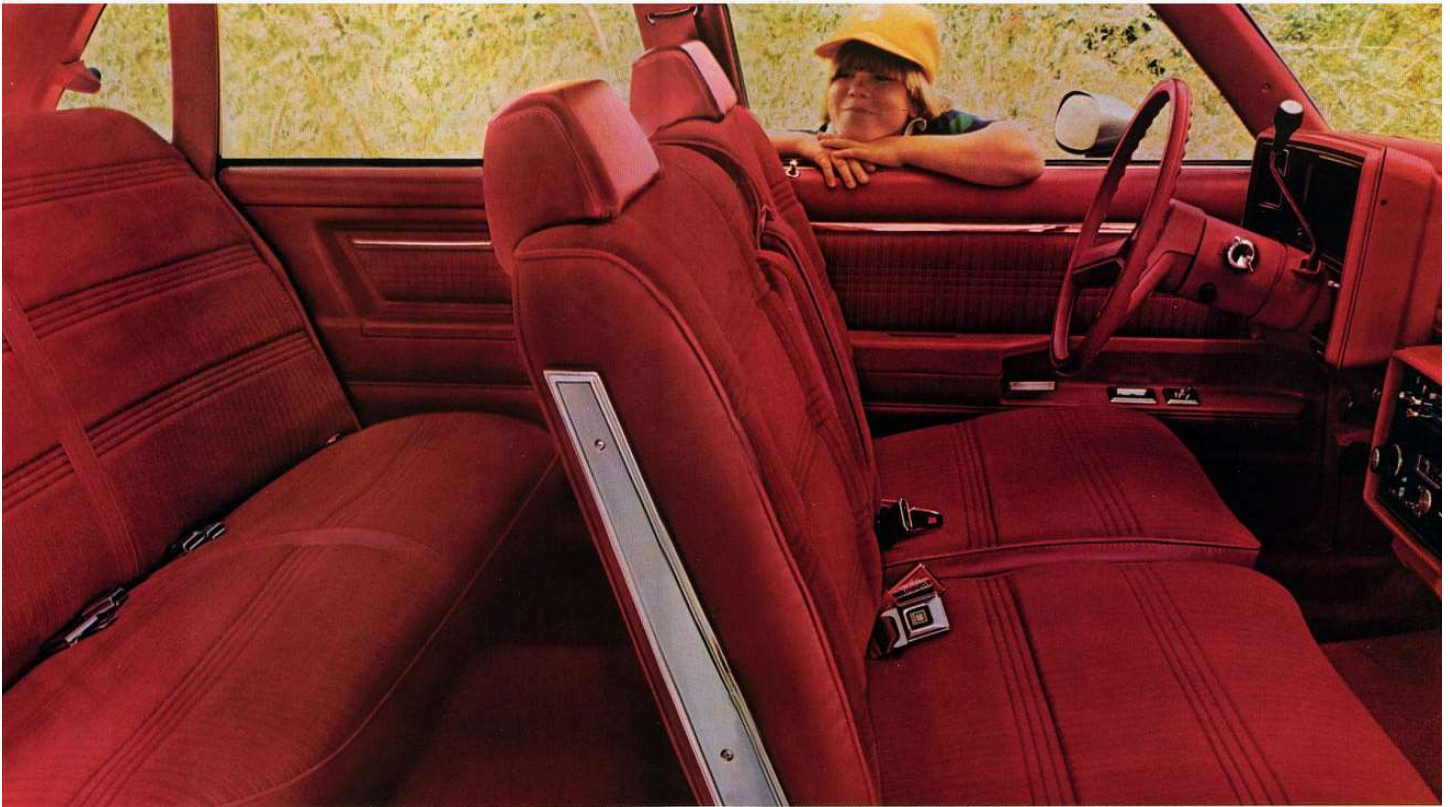
Malibu Classic standard knit cloth interior shown in carmine with available 50/50 split front seat, deluxe color-keyed seat and shoulder belts, remote control sport mirror, power windows, AM/FM stereo radio, automatic transmission and air conditioning.

Inside, comfort and quiet with lots of head and leg room for you and your friends.