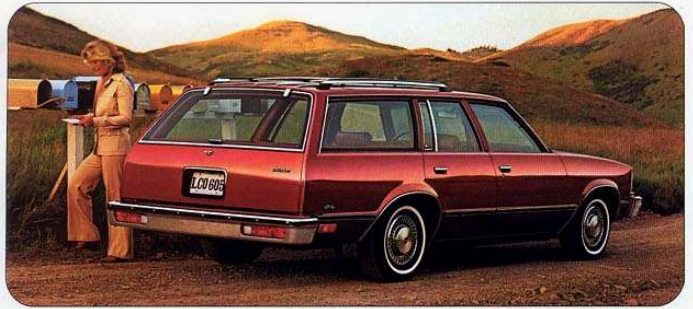
Malibu Wagon shown in dark carmine with available roof carrier, deluxe body side moldings and white-stripe tires.