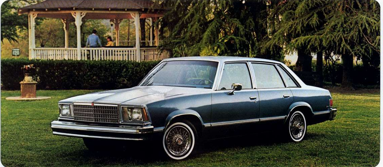
Malibu Sedan shown in available Custom Two-Tone light blue and medium blue metallic with available deluxe body side moldings, tinted glass, wheel opening moldings, wire wheel covers and white-stripe tires.