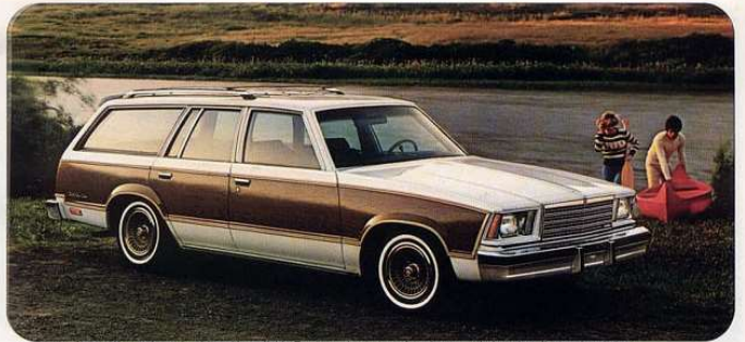
Malibu Classic Wagon shown in white with available Estate equipment, roof carrier, rear window air deflector, tinted glass, bumper rub strips and guards, sport wheel covers and white-stripe tires.