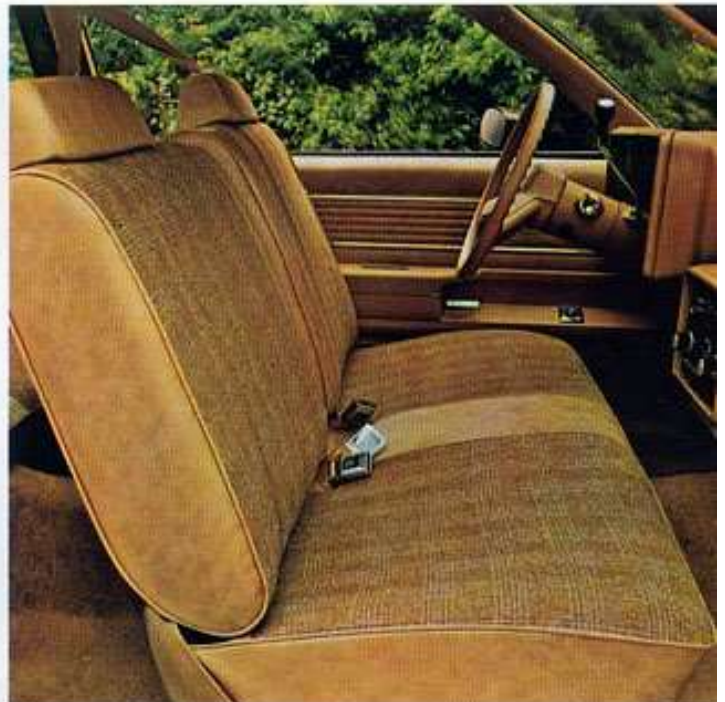
Malibu standard sport cloth interior shown in camel with available deluxe color-keyed seat and shoulder belts, remote control sport mirror, AM/FM radio, automatic transmission and air conditioning.